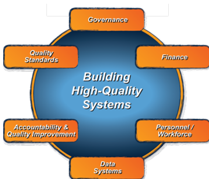
Figure 4. ECTA System Framework

Because the DaSy framework was developed on its own in addition to being a component in the ECTA system framework, it has considerably more subcomponents, quality indicators, and elements than the other five components in the ECTA system framework. In 2019, ECTA began work on revising the ECTA